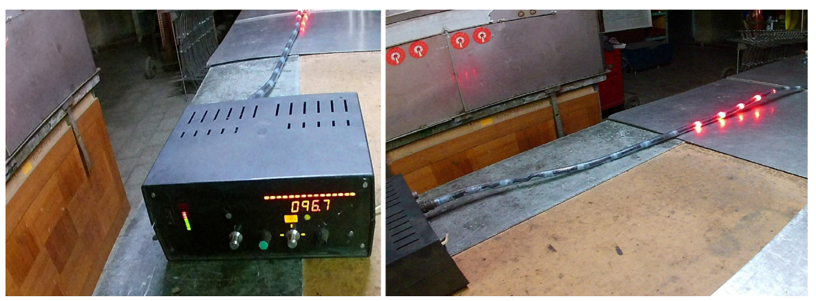
Figure 1. The Lider device (controller with arterial tube with light-emitting diodes) before installation at the bottom of the swimming pool

S. Szczepan, K. Zaton, J. Borkowski, Visual swimming speed control above OBLA